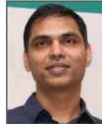
Neville Noronha Avenue Supermarts (Dmart)